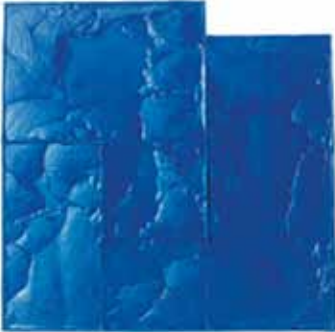
ASHLAR CONCRETE TEXTURE MATS