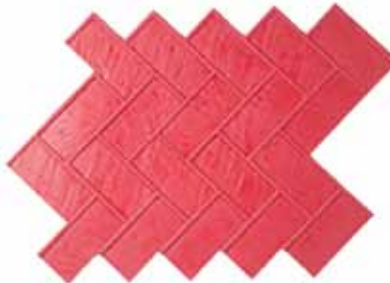
HERRINGBONE BRICK CONCRETE TEXTURE MATS