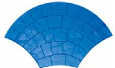
EUROPEAN FAN COBBLESTONE CONCRETE TEXTURE MATS