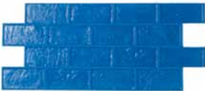
RUNNING BOND CONCRETE TEXTURE MATS