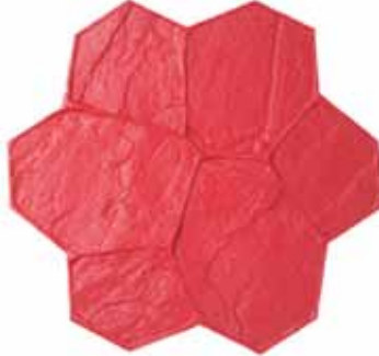
RANDOM STONE CONCRETE TEXTURE MATS